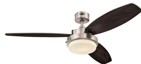
Reversible Wengue Finish Blades